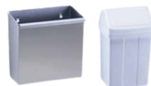
Ref: 806 395 Ref: 806 396

All these wash basins have knee-actuated controls, and the tap is turned on by pressing the paddle located on the front panel.