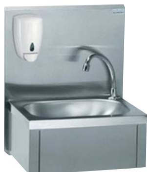
Ref. : 806 383

The GC wash basin with 540 mm high splash back: the splash back is especially designed to make splashes run back into the bowl so that the wall is completely protected against dampness. The splash back includes an integral soap dispenser, capacity 500 ml.