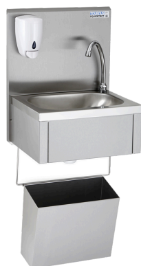
Ref. : 806 397

Wall-mounted waste bins: : made of stainless steel or made of PVC