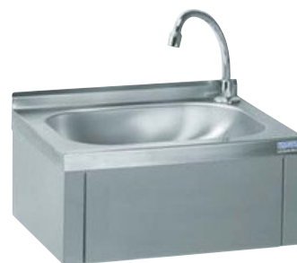
Ref. 806 381

The simple GC wash basin: the bowl, with apron around 3 sides and a 29 mm rim at the back, fixes to the wall with screws.