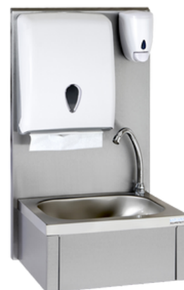
Ref. : 806 385

The GC wash basin with 790 mm high splash back: this has all the advantages of the previous model, while the higher splash back brings the additional possibility of fixing a paper towel dispenser, capacity 250 towels.