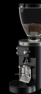
E80W GbS Weight-Based