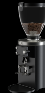
E80T GbS* Time-Based