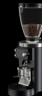
E65W GbS Weight-Based