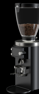
E65T GbS* Time-Based

The New Generation of Grind-by-Time & Grind-by-Weight Grinders with Sync Capabilities