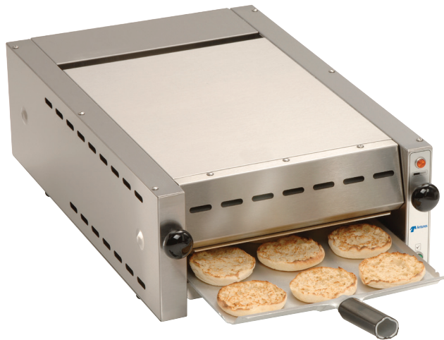
MT-12 includes spatula

Create an irresistible breakfast sandwich by serving it on a perfectly toasted English muffin. With the MT-12 Muffin Toaster, operations can toast up to 12 muffin halves in only 90 seconds, making it easy to keep up with the growing demands of the breakfast daypart.