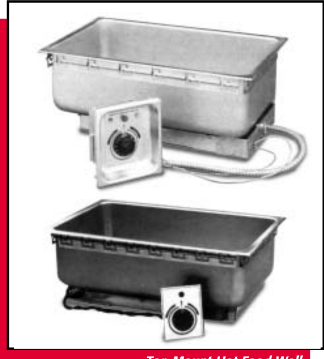
Top Mount Hot Food Well