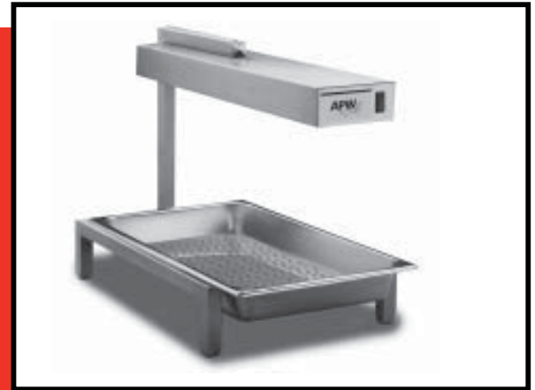
MODEL PD-1A DISPLAY WARMER