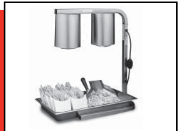
MODEL DW-1A DISPLAY WARMER