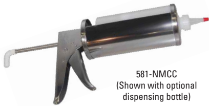
581-NMCC (Shown with optional dispensing bottle)