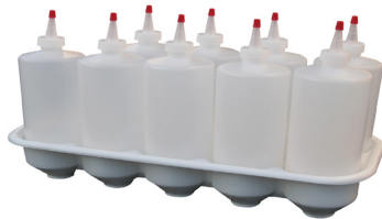
155 Bottle storage tray