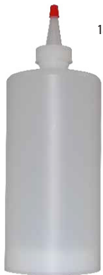
136-1 Dispenser bottles (case of 9) - reusable