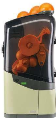
Zumex Minex Green