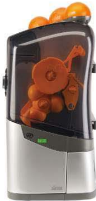
Zumex Minex Silver