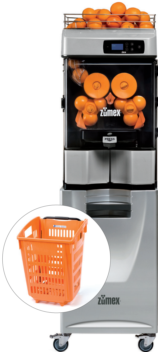
*Integrated waste trolley