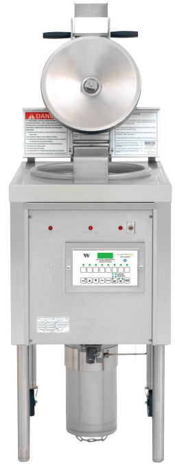
PF46 & PF56 COLLECTRAMATIC® HIGH EFFICIENCY FRYER 8-Channel Programmable Controls