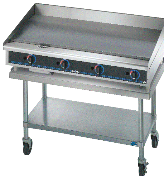
Model 648MD with Optional Equipment Stand