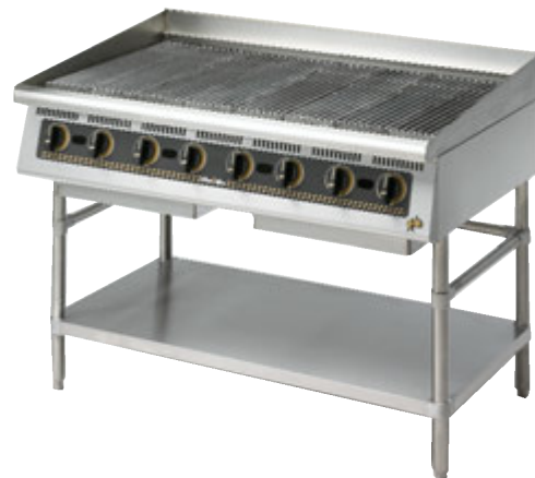
Model 8036CB Shown with Optional Floor Stand