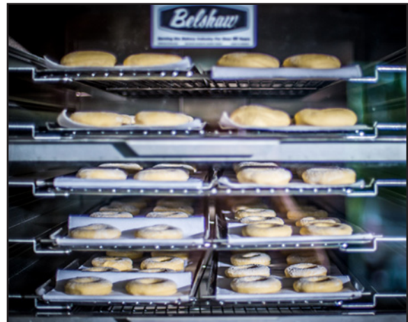
Below: EP18/24 with Donut Robot Mark II or Mark V Trays/Cloths