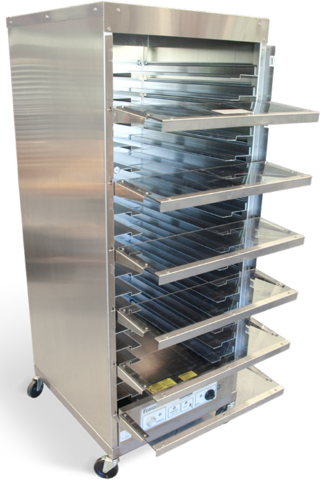
Above: EP18/24, 17 shelves, 6 doors