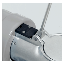
Microswitch on the lever