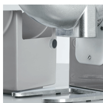
Collecting tray with microswitch