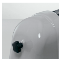
Cut thickness adjusting knob