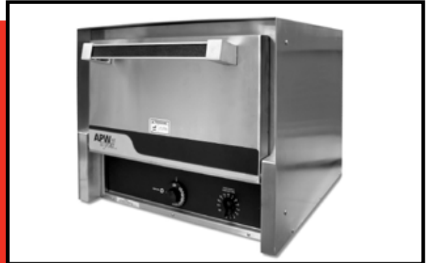
Countertop Deck Oven

Unit construction offers stainless steel top, sides, and door liner with an aluminized steel oven liner and stainless steel door liner. The unit is insulated on all sides. Oven compartments has two ceramic phosphate decks 16 ½" x 16 ½" which are removable to allow for easy cleaning. Decks are 3-1/2" apart. Oven's thermostat range is 300F– 500F and includes a 15 minute timer. Thermostat controls three sheath-type electric elements. The locations of the three elements are: one under each deck and one at the inside top of the oven